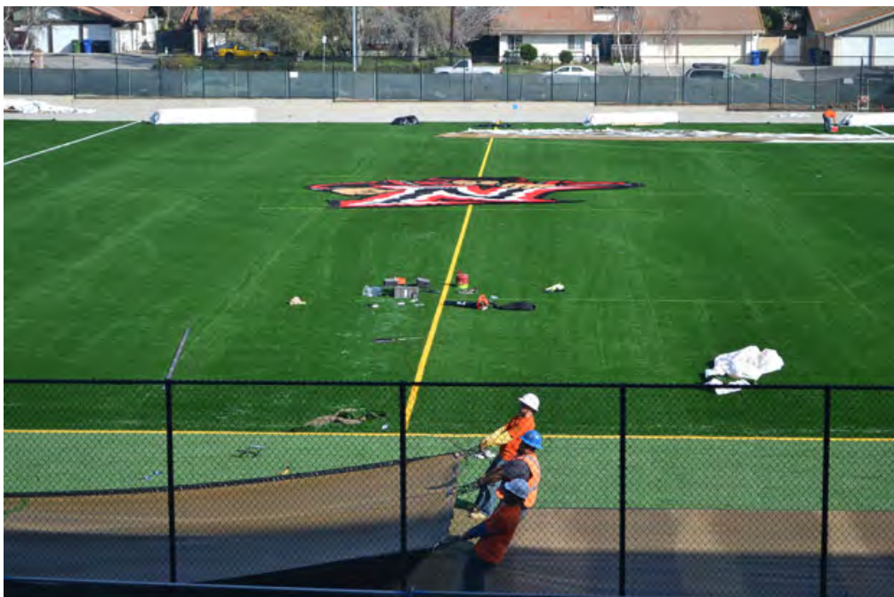
FieldTurf construction workers drag the polyurethane grass across the side of the main field.