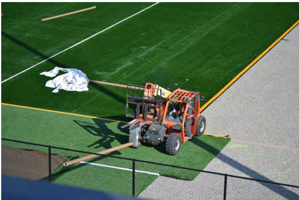
OHNO construction workers and FieldTurf Co. install the polyurethane grass and insert grass sections with colored lines that are sport specific.