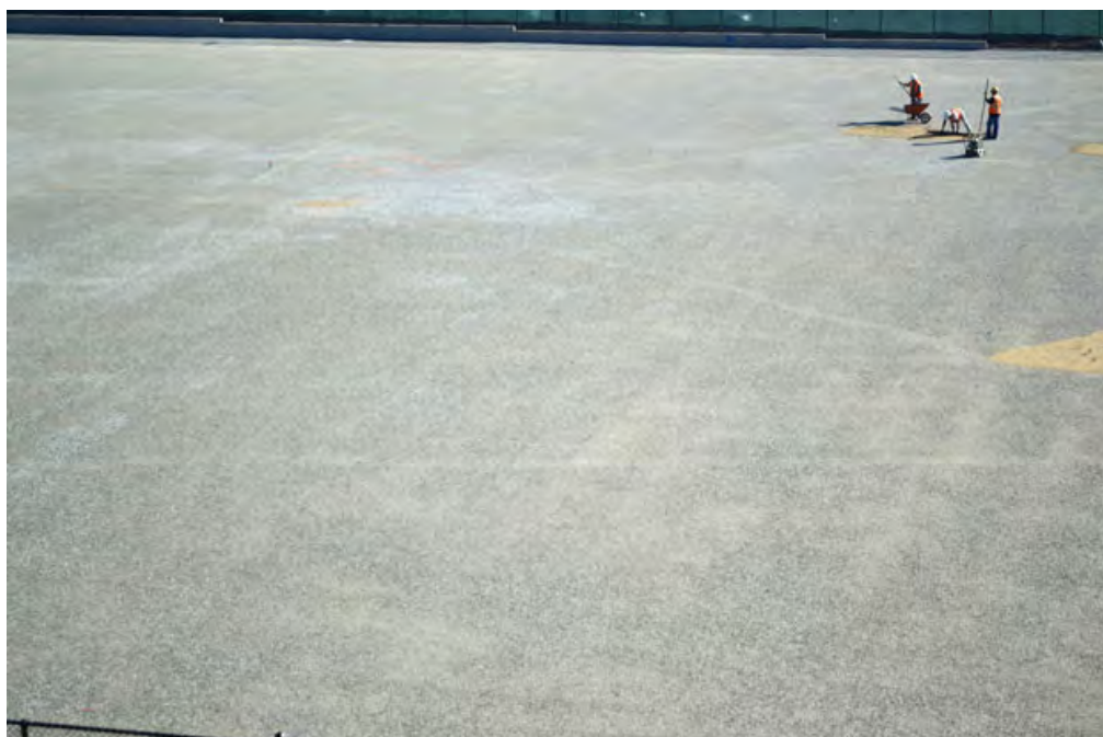
OHNO construction workers make sure that gravel is consistently flat and level before the grass can be placed on the field.